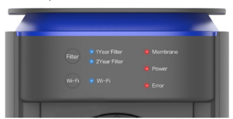
Figure 1. Smart RO unit LED indicators